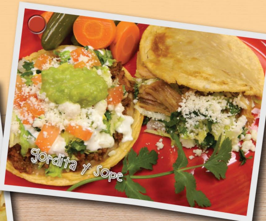
Gordita y Sope